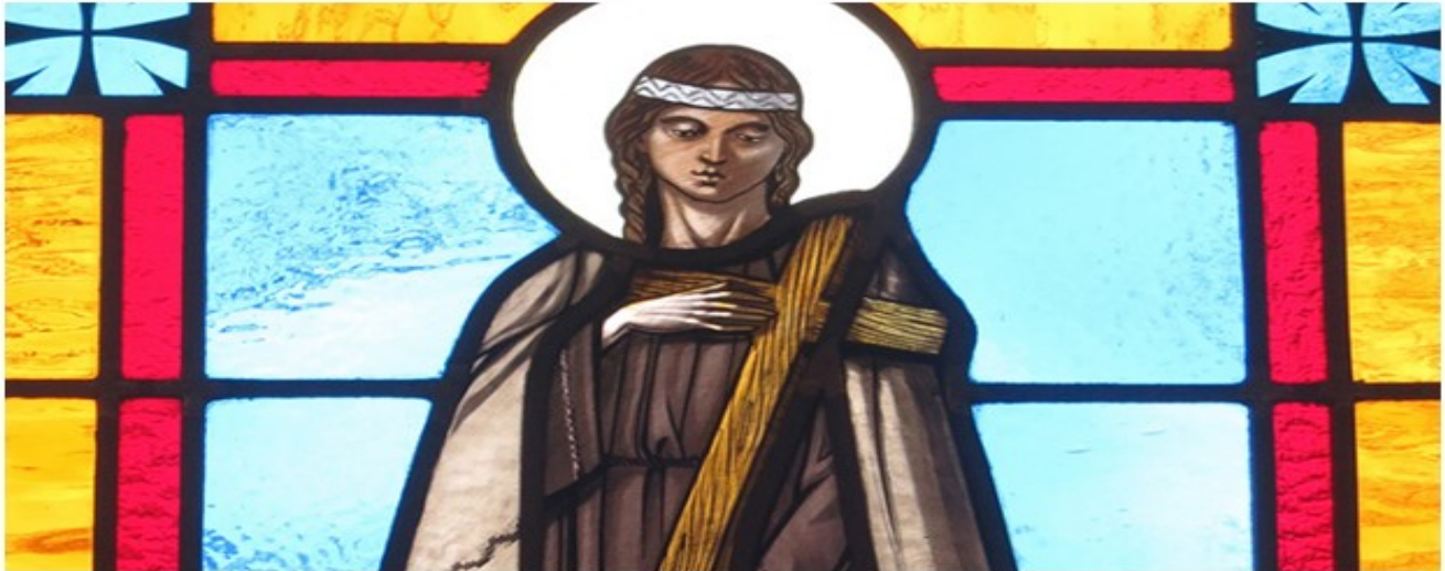
Saint Kateri Tekakwitha (Feast Day: July 14 th )

She was born near the place of the martyrdom of the Jesuits Isaac Jogues and Jean de Lelande, Auriesville, New York.