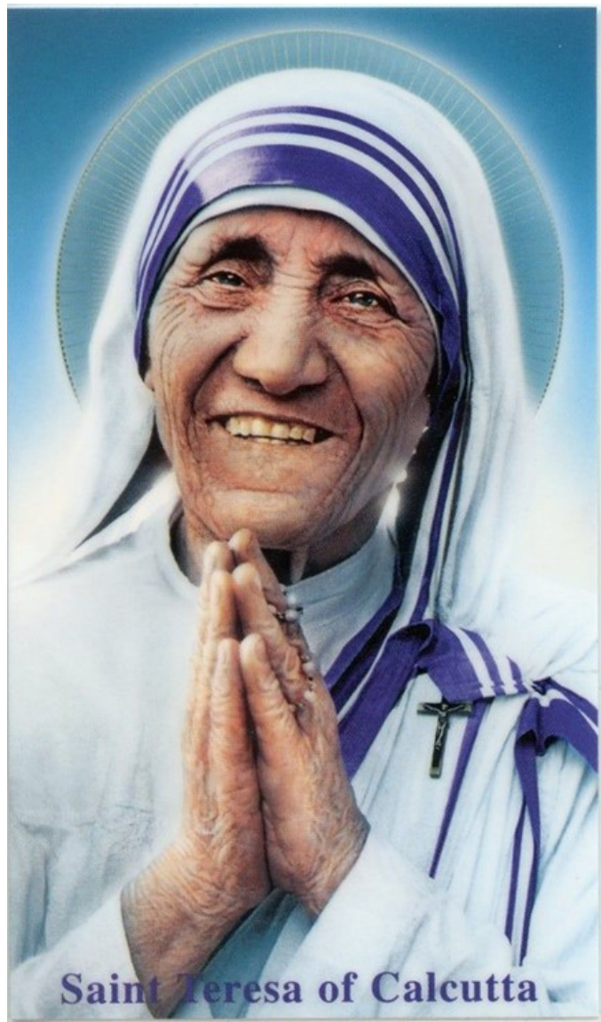
Saint Teresa of Calcutta

January 14, 2024 SECOND SUNDAY IN ORDINARY TIME