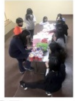
Dedicated to SERVICE