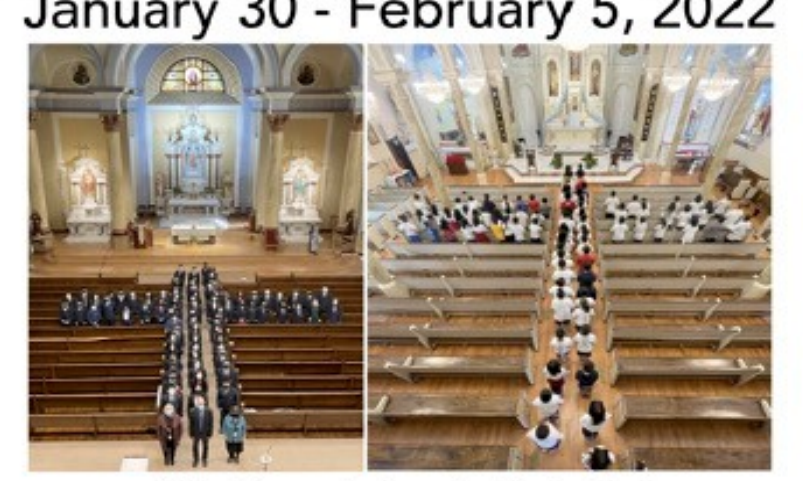
United in FAITH