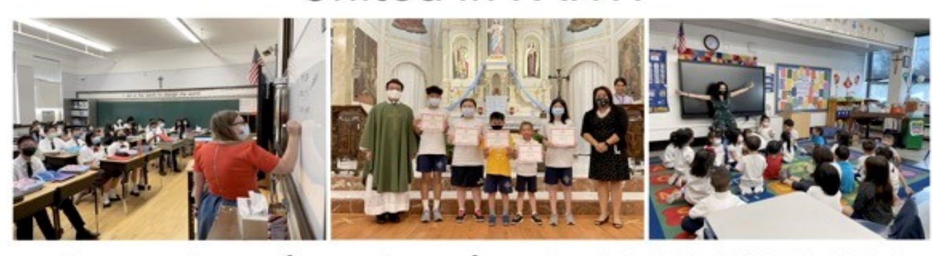
Committed to Academic EXCELLENCE