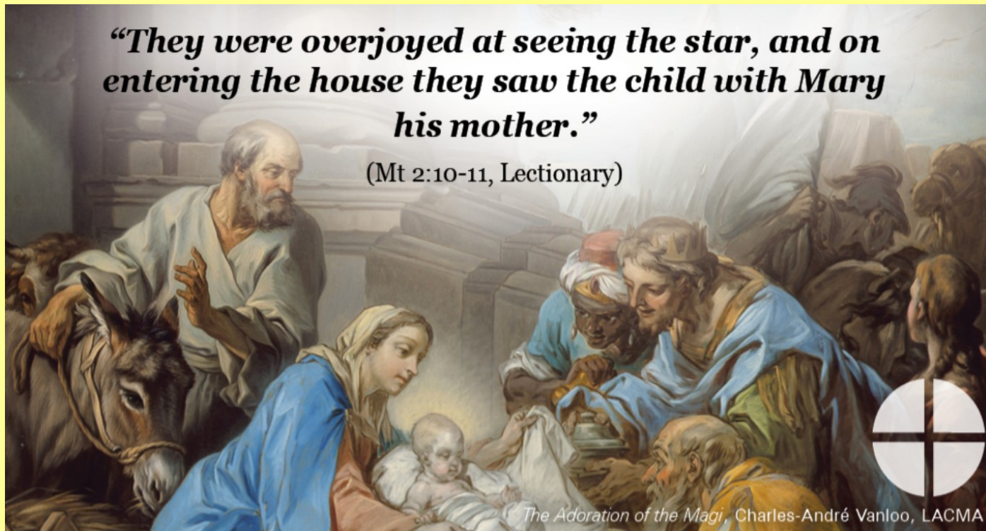
The Adoration of the Magi, Charles-André Vanloo, LACMA

Today the Church celebrates the Solemnity of the Epiphany of the Lord. In popular tradition, this day commemorates the arrival of the three Kings at the stable in Bethlehem where Christ was born. The Gospel reading for the day – Matthew 2:1-12 – tells the story.