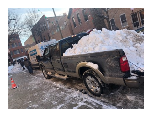
More LNY Photos on the next page & on our website!