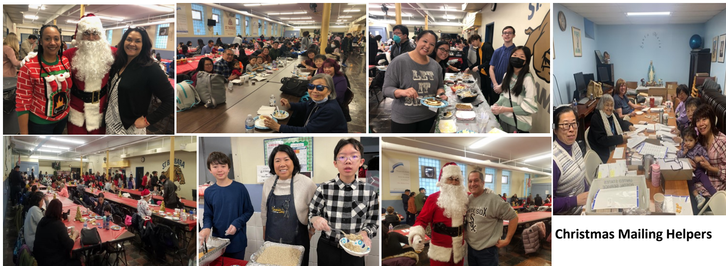
Christmas Mailing Helpers

Thanks to all who helped with this year's Christmas mailing. Our dedicated volunteers and staff once again did an amazing job